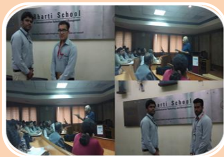
Conference / Seminar / Summit